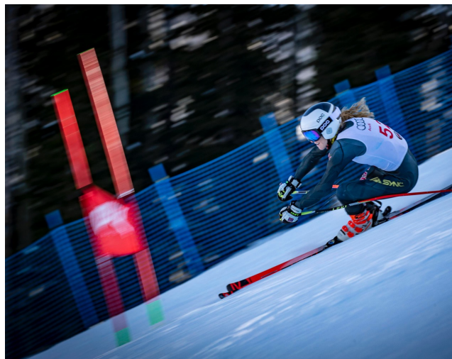
2021 DU Invitational at Aspen Highlands.

Consideration will be given to highly motivated high school graduates who are on track to make a national team or Division I collegiate team. We will compete at the FISU, FIS, and NorAm level. Athletes must demonstrate our core values: commitment, teamwork, integrity. The group will be approximately 12 athletes.