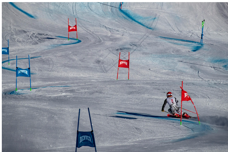
2021 DU Invitational (FISU) at Aspen Highlands.